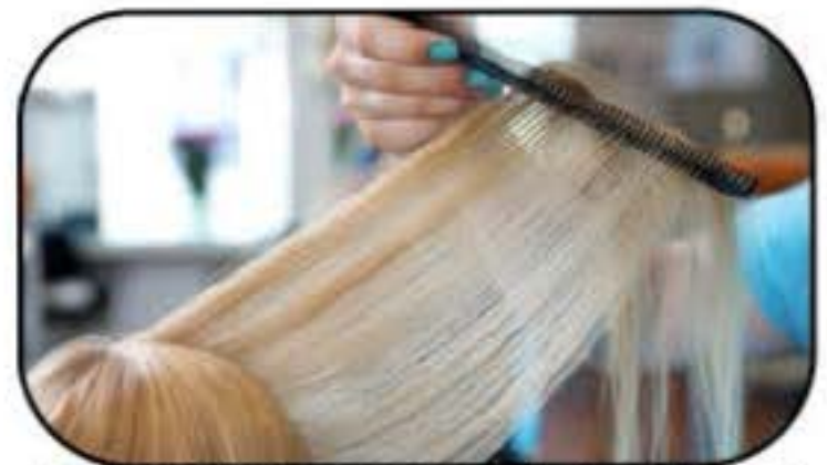
COMB HAIR FREE OF TANGLE