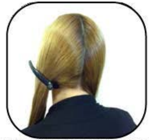
CLIP AWAY ONE SIDE

3- Divide the hair in the middle in two half section. Clip away one half section from the back towards the front using one of the two Sectioning Clips provided, to keep it out of the way while treating the other side. Repeat it on the opposite side after finish treating the first half section. Now you are ready to begin treatment.