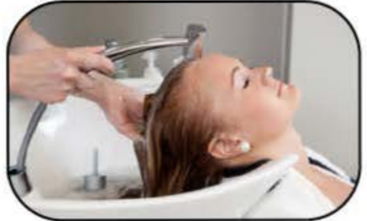
WASH THE HAIR

2- Comb hair completely free of tangles before using the Split-Ender PRO to avoid hair pulling. The Split-Ender PRO should run through your clients hair nice and easy.