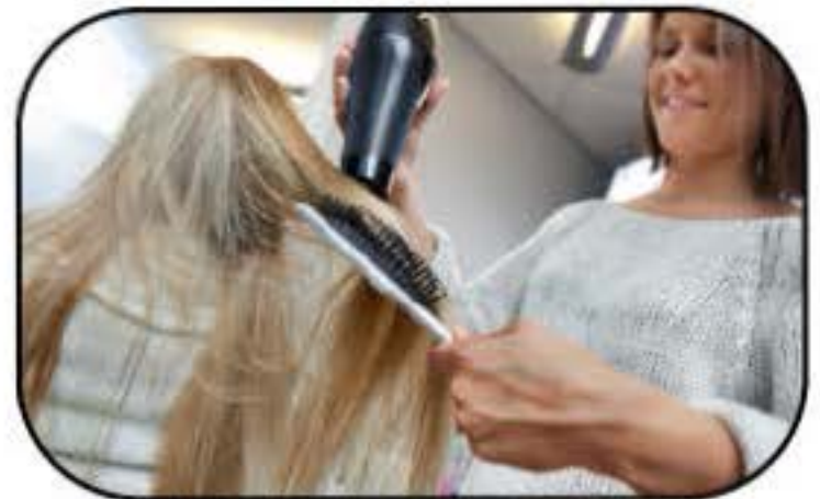
BLOW DRY THE HAIR